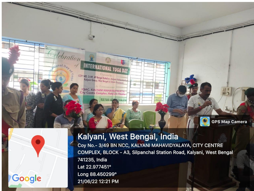
Celebration of International YOGA DAY-2022 (Photo 2) Date: 21/06/2022