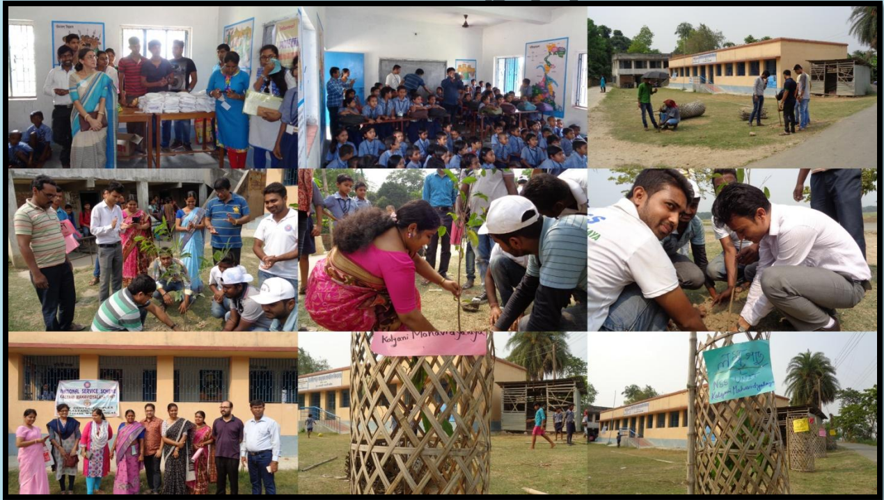
PICTURES OF SPECIAL CAMP